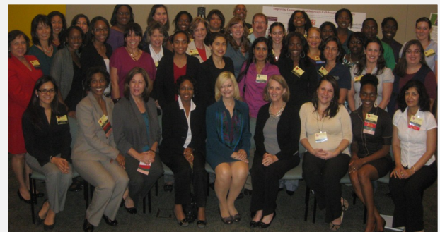
TSOPHE 2011 Conference Members & Attendees

For more information, check out www.tsophe.org .